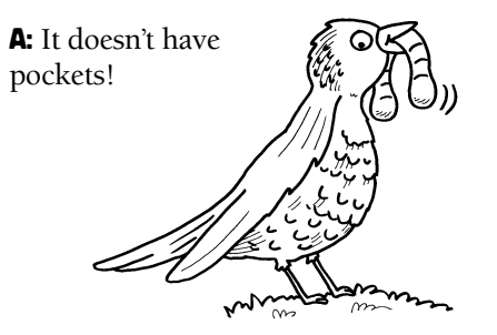
© 2015 Resources for Educators, a division of CCH Incorporated

Q: Why does a robin carry worms in its beak?